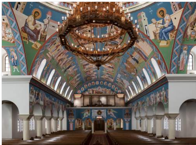
St. George Orthodox Christian Cathedral, Wichita