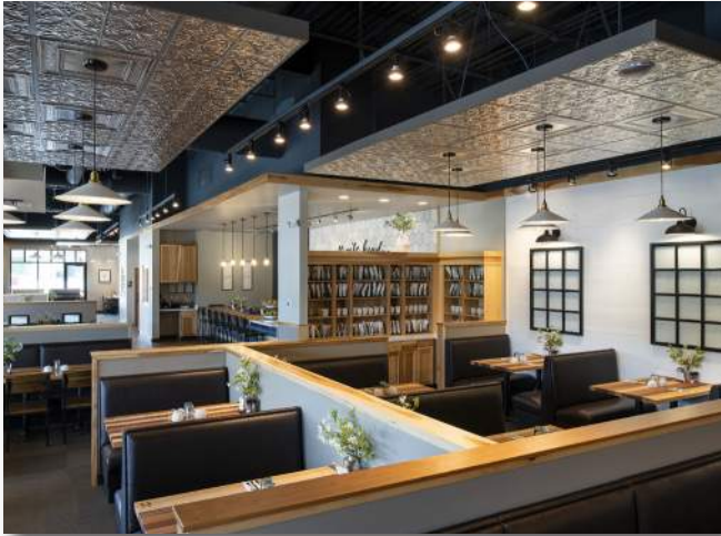
HomeGrown at Bradley Fair