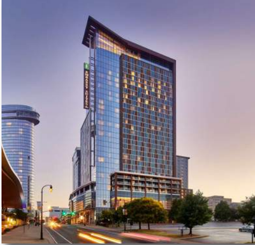
Embassy Suites/1 Hotel - Nashville, TN