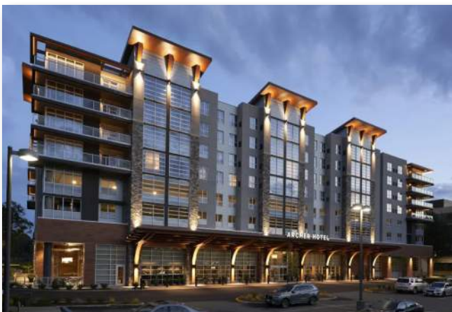
Archer Hotel - Redmond, WA