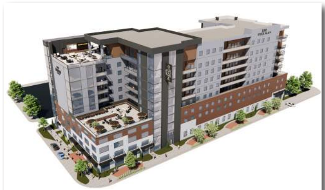
Indigo/Apartment Multi-Use Project SPT Architecture Rendering