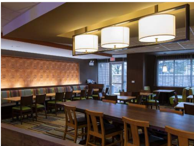
Fairfield Inn & Suites by Marriott, Wichita