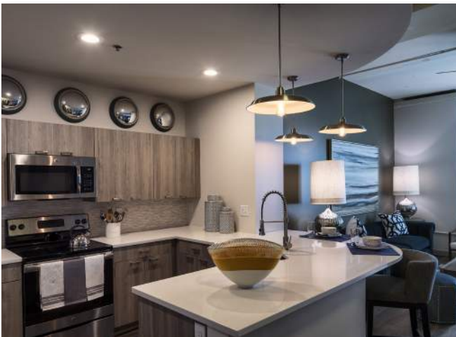
The Douglas Tower II