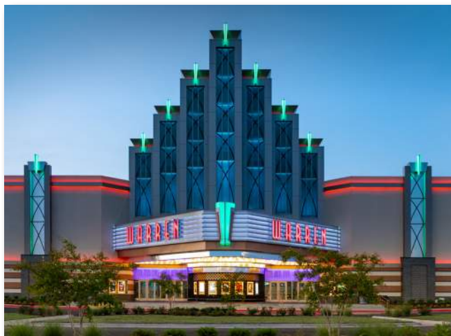
Warren Theatre, Broken Arrow, OK