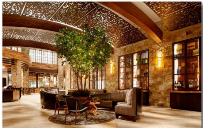
Archer Hotel - Napa, CA

Hyatt Place 4 Locations in CA, CO, KS & MA Hampton Inn, Manhattan ADA Survey & Exterior Restoration Analysis Best Western Arkansas City Addition - Blackwell, OK Mainstay Suites by Choice 6 Locations in FL, MO, NY, RI & SC Sleep Inn by Choice, Kansas City, MO