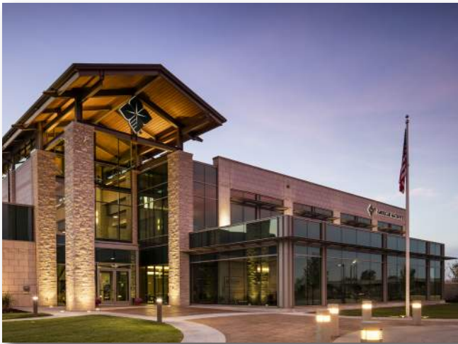
American AgCredit Regional Headquarters, Wichita

Facility Planning/Programming Master Planning Feasibility Studies Site Selection/Planning/Analysis Land Use Studies Landscape Design