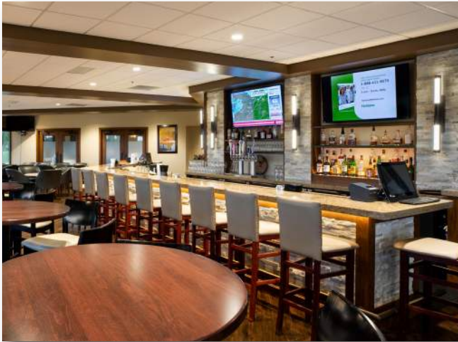
Rolling Hills Country Club