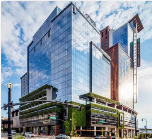
Embassy Suites/1 Hotel - Nashville, TN