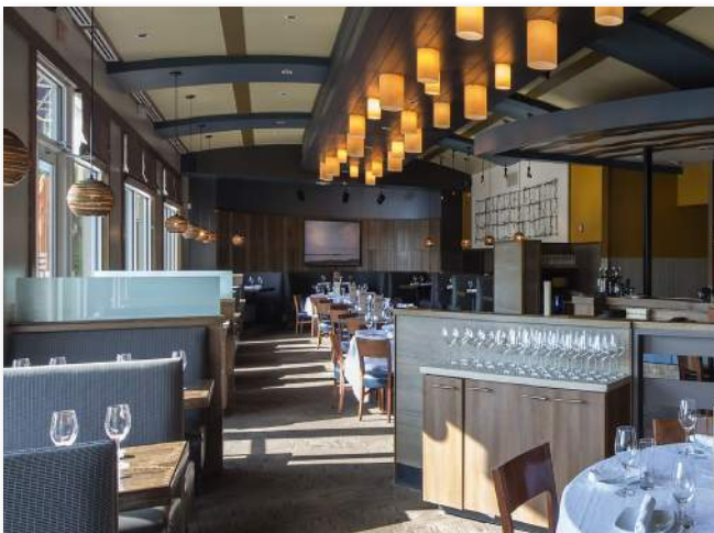
Newport Grill at Bradley Fair