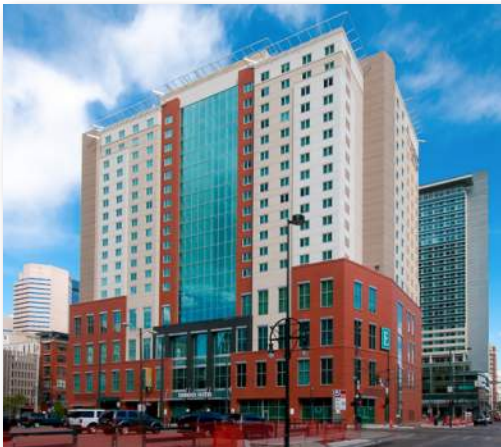
Embassy Suites - Denver, CO