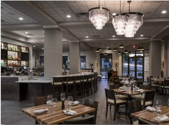
Vora Restaurant European