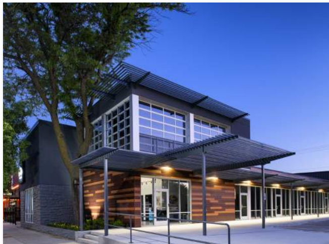
810 West Douglas Renovation, Wichita