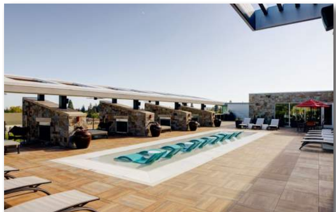
Archer Hotel - Napa, CA