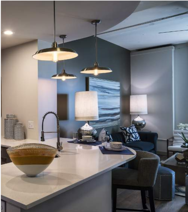
The Douglas - Tower II