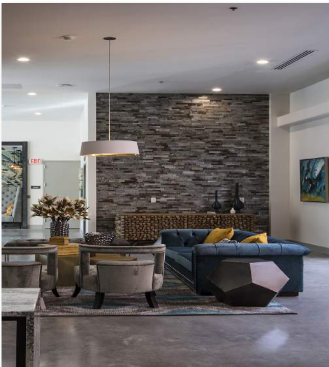
The Douglas - Tower II Community Room

Ken Stoppel Building Controls and Services (316) 267-5814