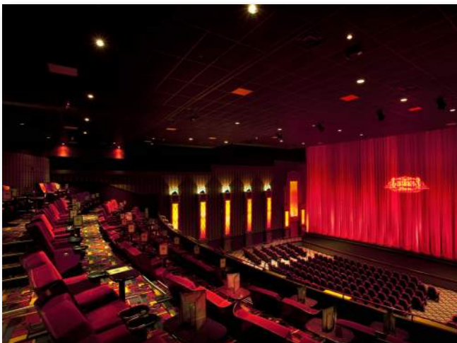
Warren Theatre - Moore, OK