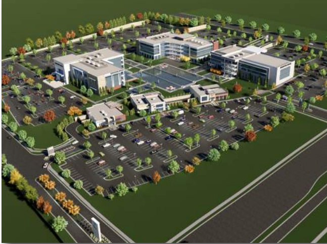
Reflections at City Center, Lenexa