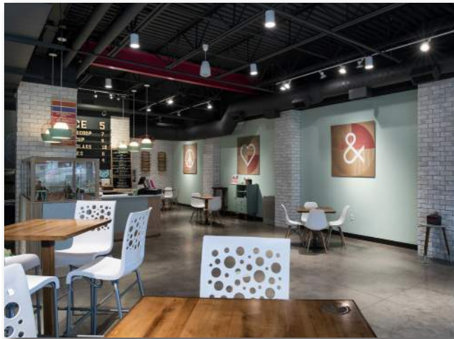
Peace, Love & Pie