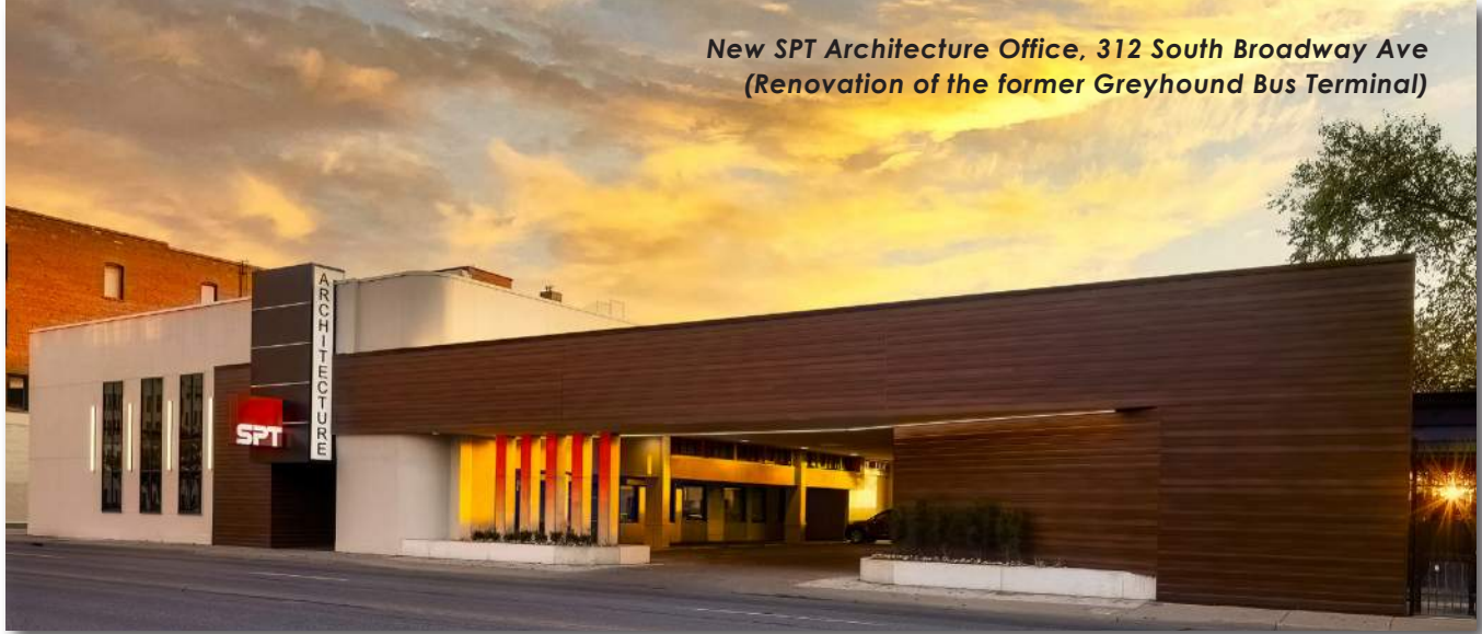
New SPT Architecture Office, 312 South Broadway Ave (Renovation of the former Greyhound Bus Terminal)