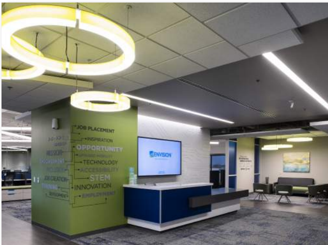
Envision Workforce Innovation Center, Wichita

Architectural Design Architectural Renderings Construction Documents Landscape Design Bidding/Pricing Negotiation Coordination Contractor Selection Assistance Construction Administration