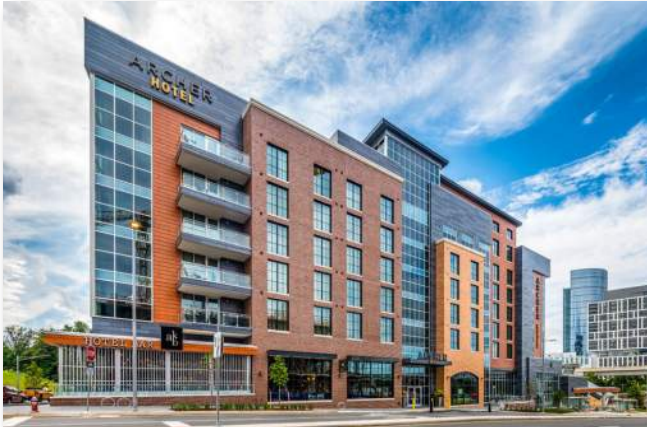
Archer Hotel - Tysons Corner, VA