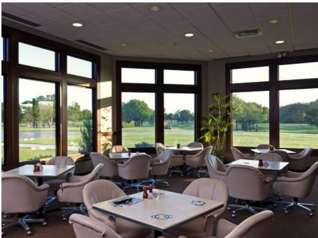
Oakwood Country Club, Enid