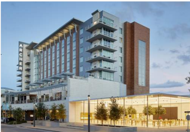
Archer Hotel - Austin, TX