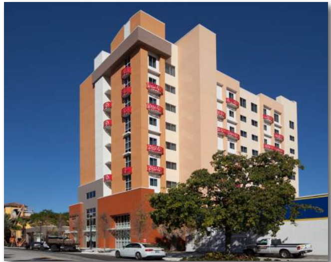
Residence Inn - West Palm Beach, FL

4th Avenue Apartments, St. Petersburg, FL Solheim Luxury Condos, Manhattan, KS Arena Lofts, Lincoln, NE 11b Apartments, Manhattan, KS Avenue M Apartments, Manhattan, KS Phase 1 and 2 Wheatshocker Student Housing